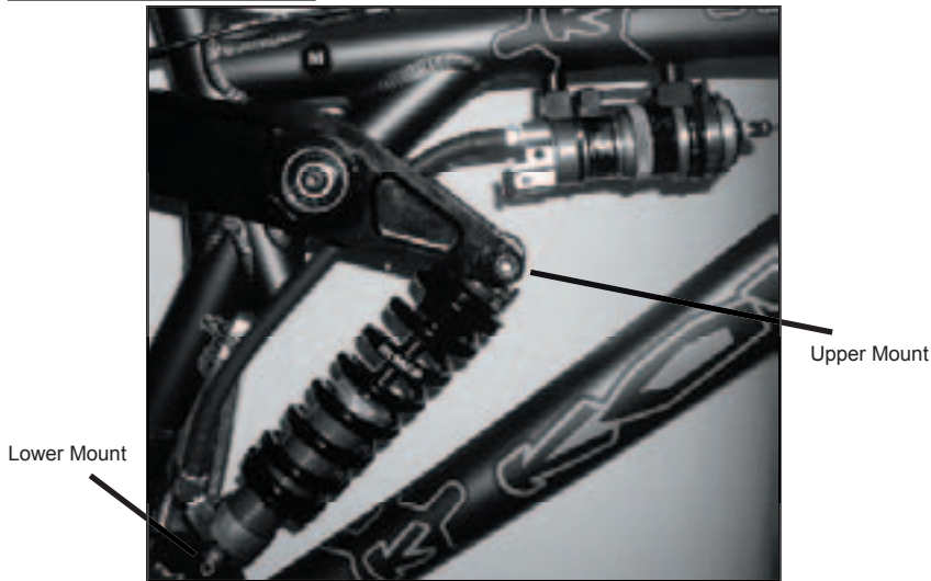
KONA Stab Primo