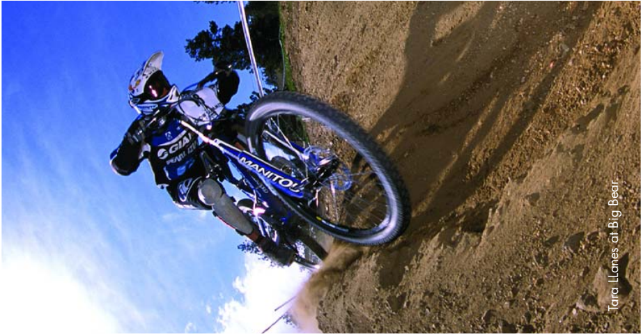
Tara Llanes at Big Bear.