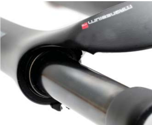
SF-Duro DJ triple