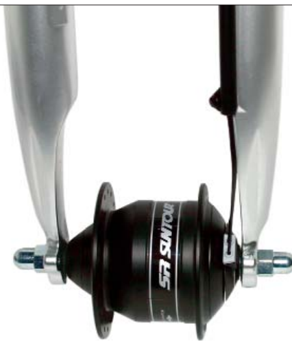
Integrated cable and lamp mounting solution

Available on SF7 NEX series, SF7 NEX series, SF7 CR8 and CR9 series as an option