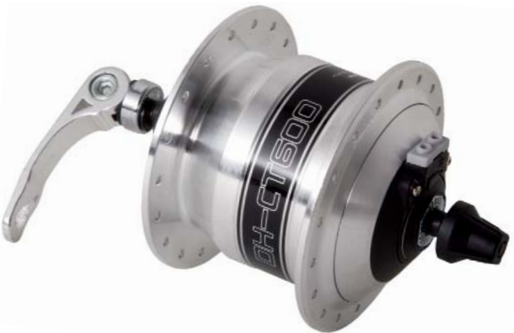
SUSPENSION SEAT POSTS / HUB DYNAMOS / PEDALS