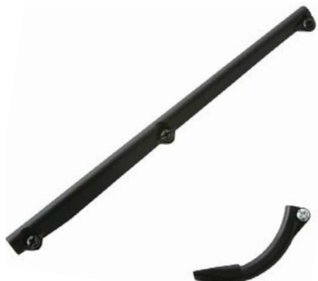
for CR9 series forks