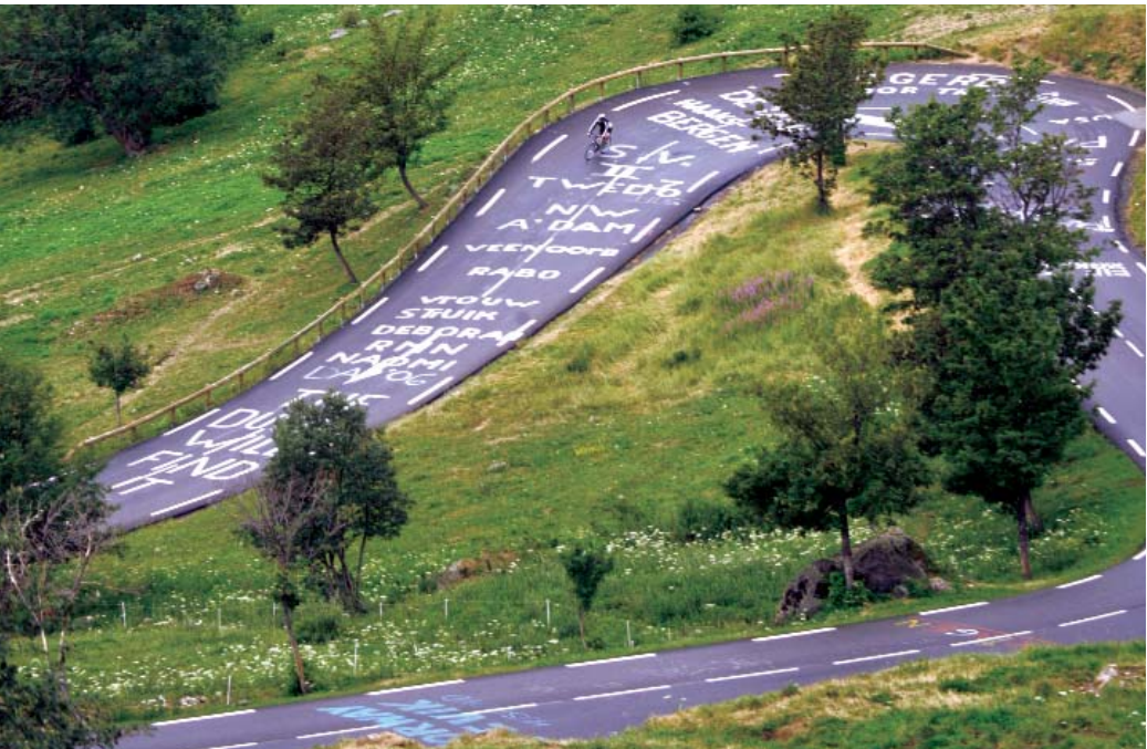
picture Legendary ascent to Alpe d'Huez France