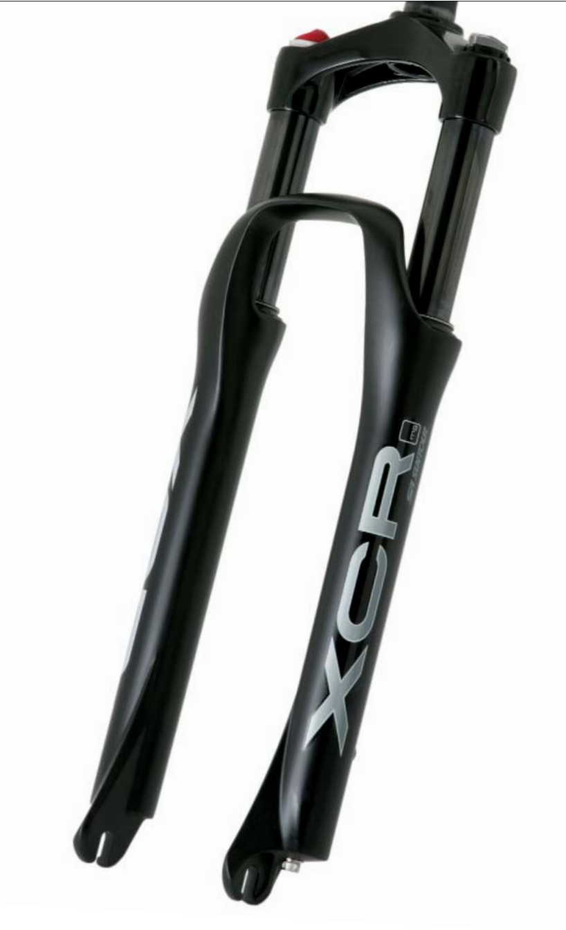
SUSPENSION FORKS 26"