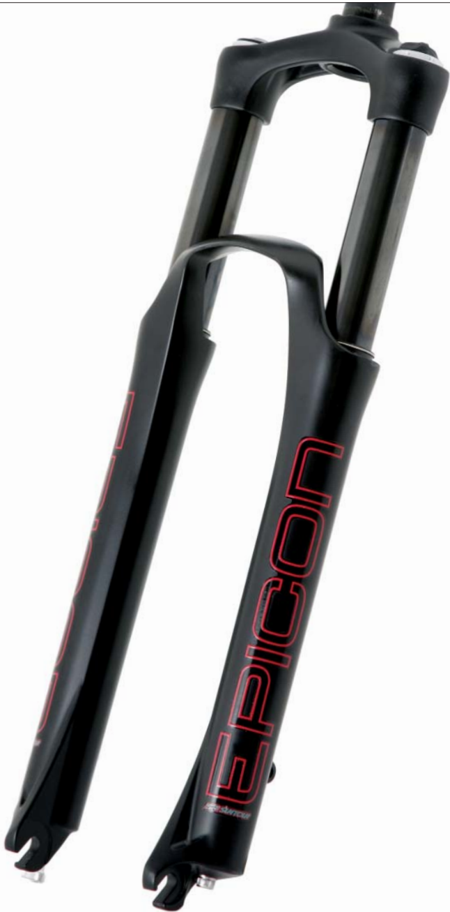
SUSPENSION FORKS 26"

N/A 100 or 120 or 140mm Air / Hydraulic damping w.rebound adjust New magnesium monocoque light weight design Leading axle / Disc only design Alloy w/reaming Mat black, Metallic silver Forged alloy Semi-ID type / 44mm Shot anodized (Black or Silver) Cro-mo / Black finish New hydraulic damping w/rebound adjust cartridge New air spring system Cro-mo 255mm 30mm 26" Disc (International standard type) Yes Air pressure adjust V- & Discbrake type bottom case available (100mm or 120mm travel) 1900g