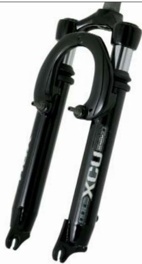
SUSPENSION FORKS 26" / 24" / 20"

80 (50) (40)mm Coil spring Oversize steel Leading axle Resin Gloss black, Metallic silver Alloy Semi-ID type / 43mm Black or Barrell STKM / CP finish / Miniboosts Coil spring Coil spring STKM 255mm 150, 180, 210mm 30, 27mm 26", 24", 20" Disc & V-type N/A