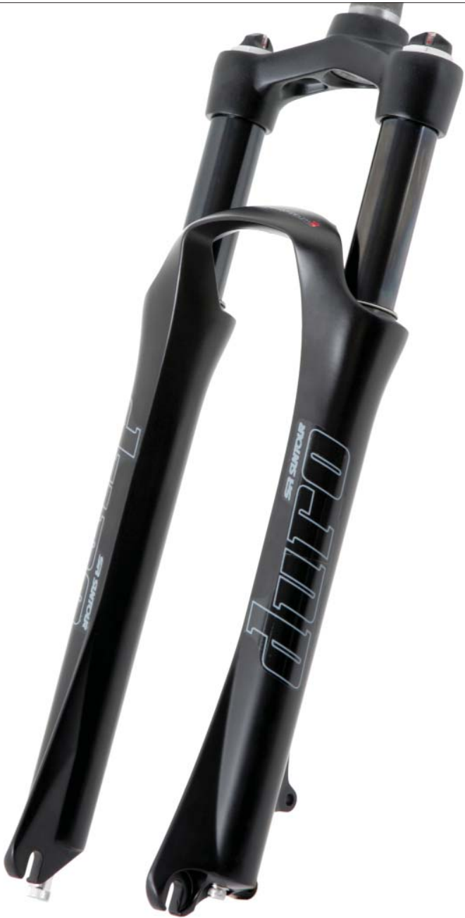
SUSPENSION FORKS 26"