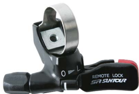
SL6-SC-RLO Remote Lockout Lever Compact design and dual-action