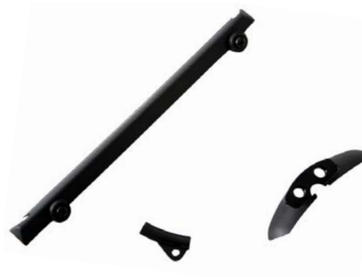
for SF7 NCX series forks