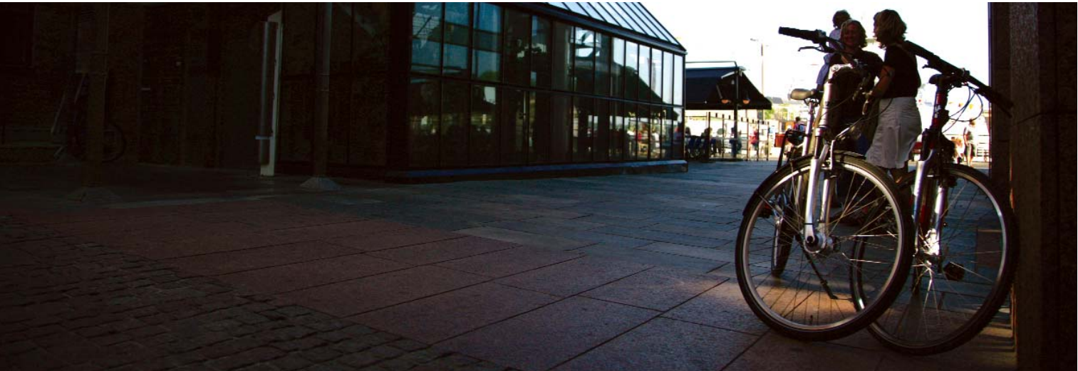
SUSPENSION FORKS 700C / 26" / 24" / 20"