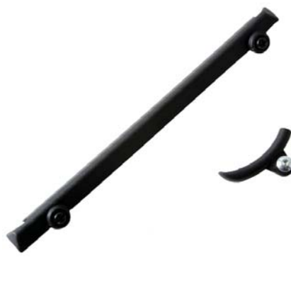
for SF7 NEX series forks