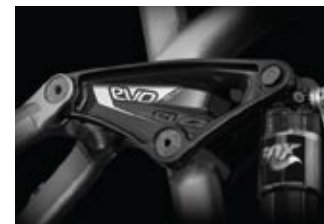
EVO LINK. The lightest, stiffest rocker link system around.