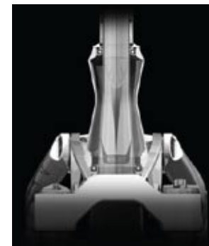
E2 TAPERED STEERER. High-speed stability and more precise steering.