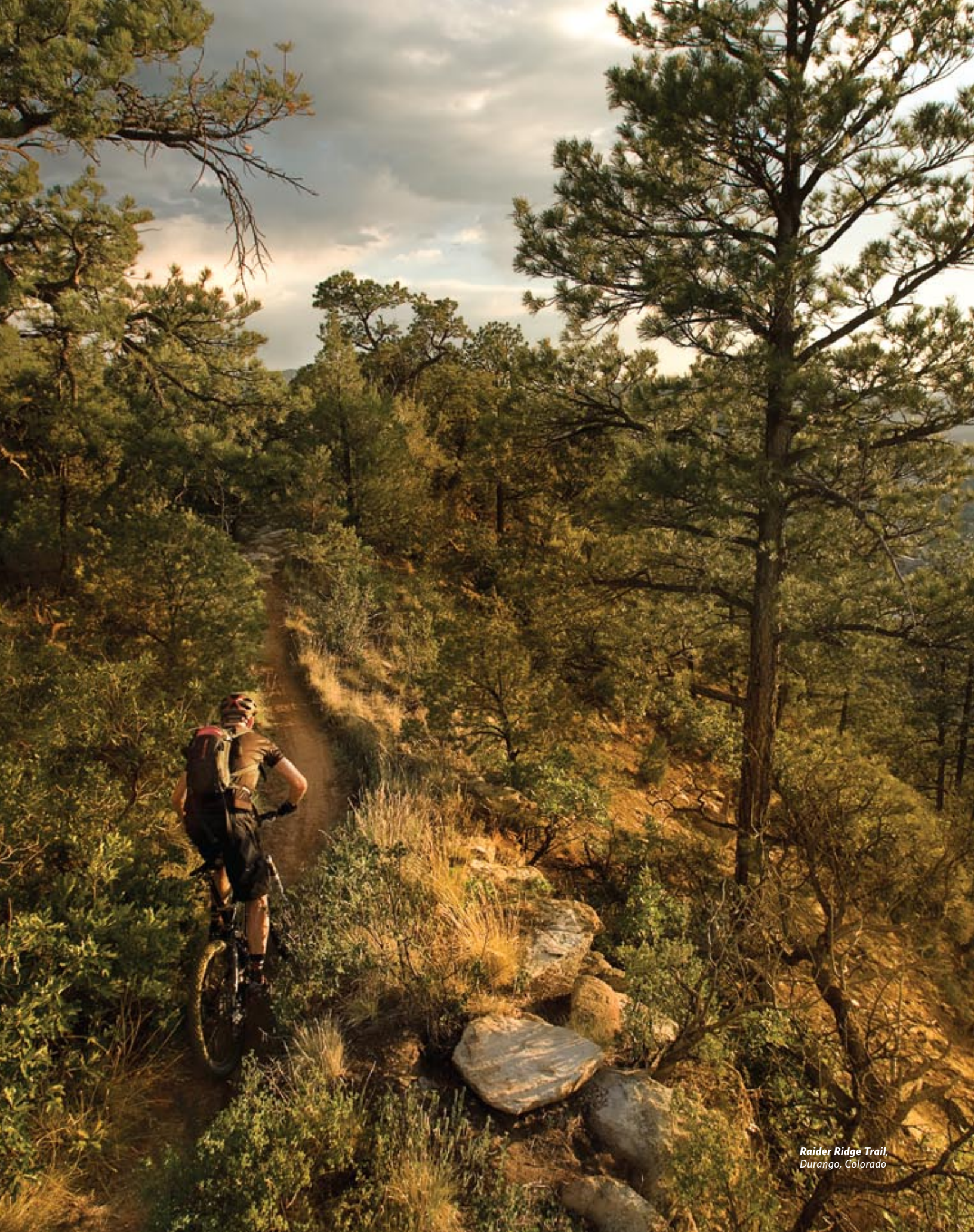
Raider Ridge Trail, Durango, Colorado