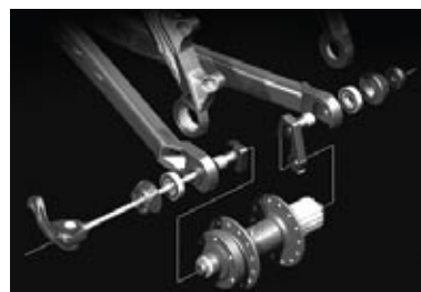
ABP (ACTIVE BRAKING PIVOT). The most active rear suspension.

E2 TAPERED STEERER. E2™ tapered frame and fork technology employs an ultra-stiff, 1.5" lower-diameter steerer that tapers to a 1 1/8" upper. This system allows the lightweight benefits of a traditional 1 1/8" with the stiffness of a 1.5", giving better high-speed stability, more precise steering and more control in all situations.