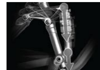
FULL FLOATER. Seemingly bottomless travel.