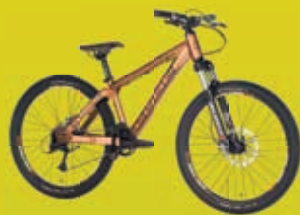
Flying Circus Brown