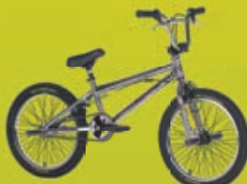
Black Cross Chrome