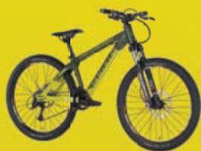
Flying Circus Olive