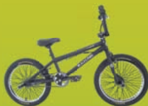
Black Cross Black