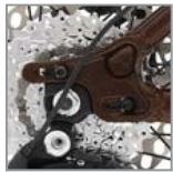
Adjustable Horizontal Dropout