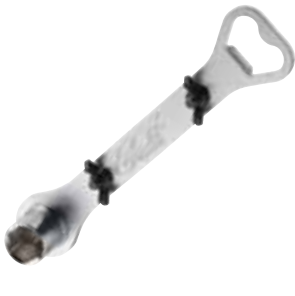
Felt BeerNuts Tool