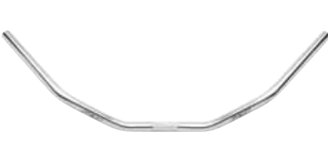
Felt Classic Low Rise Cruiser Handlebar