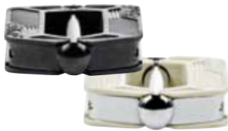
Felt Cruiser Pedals