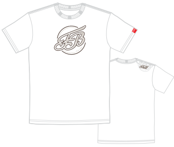
Felt Cruiser T-Shirt

Producing quality parts and accessories is a key part of Felt's quest to design, develop and deliver the best bicycles in the world. While it's possible to produce quality bikes by creating great framesets and outfitting them with off-the-shelf parts, Felt is focused on taking the process one step further. By developing the parts and accessories with the same approach and attention to detail found on our bikes and frames, we ensure the ability to optimize critical performance features and dimensions for improved strength, fit, weight, performance and value. It gives us total control over the complete package. Felt's parts selection has grown each year based on the needs of our bikes. Offering everything from forks to fenders, our parts reflect Felt's broad range of bikes. Not many other brands have the expertise to create world-record track bikes, Tour de France road bikes, World Cup mountain bikes, Olympic triathlon bikes, X-Games winning BMX bikes, city commuters and stylish cruisers. Felt understands that cycling is a personal experience, and that every rider has individual tastes and style. With that in mind, the wide variety of parts and accessories available for Felt's lifestyle bikes—including custom handlebars, fenders, saddles and tires—are all focused on one objective: enhancing your ride.