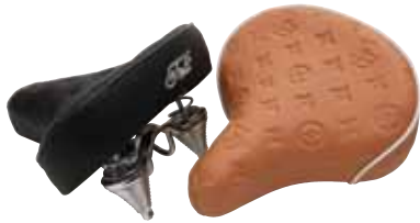
Felt FB Cruiser Seat