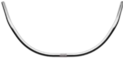
Felt High Swoopy Cruiser Handlebar