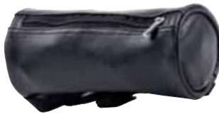
Felt MP Cruiser Saddle Bag