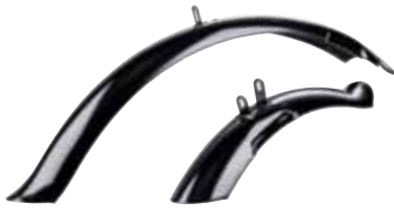
Felt Shorty Fender Set