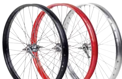
Felt 26" Cruiser Wheels