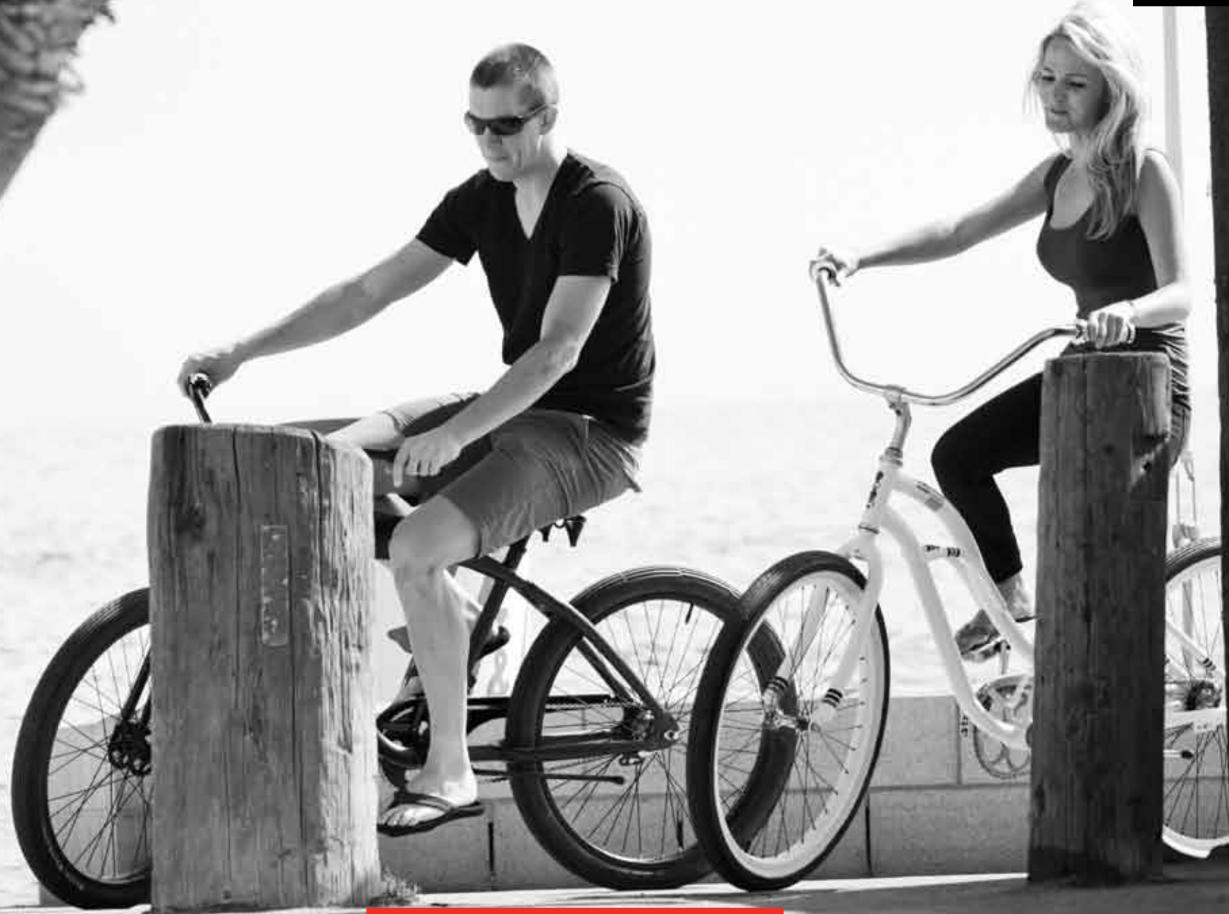
The Cruiser Series

Whether you prefer high style or simple, laid-back comfort, there's a Felt Cruiser with your name all over it.