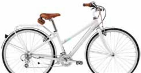
Café24 Deluxe Women's