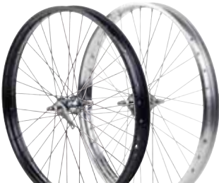
Felt 24" Cruiser Wheels