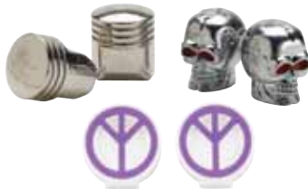
Felt Cruiser Valve Caps