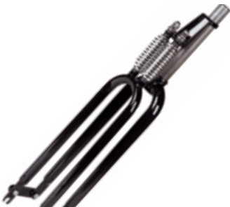
Felt Abraham Linkage Cruiser Fork