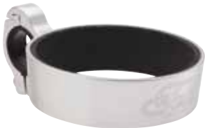
Felt Café Coffee Cup Holder