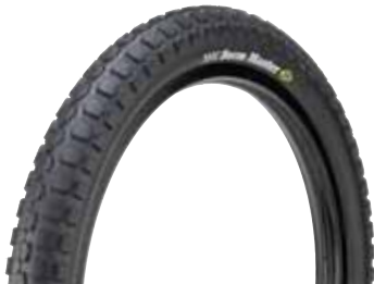
Felt Berm Master Cruiser Tire