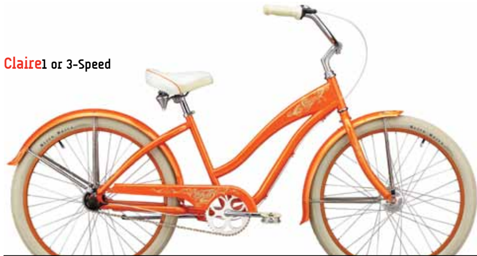
Claire1 or 3-Speed