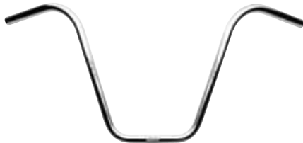
Felt Ape Hanger Cruiser Handlebar