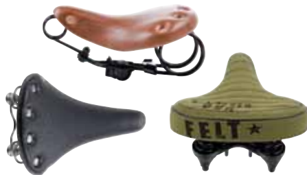
Felt Men's Cruiser Seats