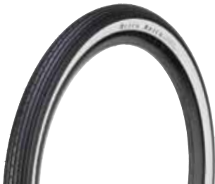
Felt Quick Brick Cruiser Tire