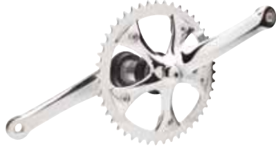
Felt Alloy Cruiser Crankset