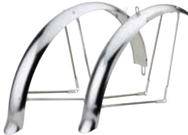
Felt Full Length Fender Set