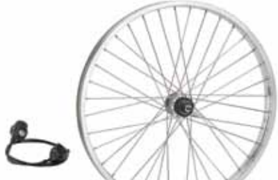
Felt 3-Spd Rear Wheel & Conversion Kit