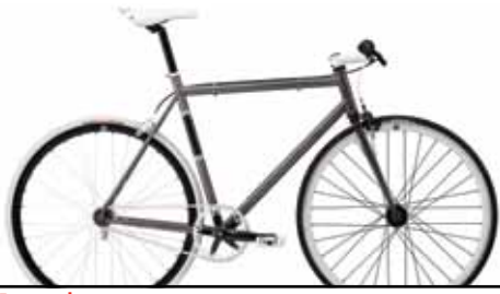
BroughamGloss Raw Clear (also available as a frame)