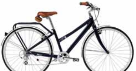
Café8 Deluxe Women's