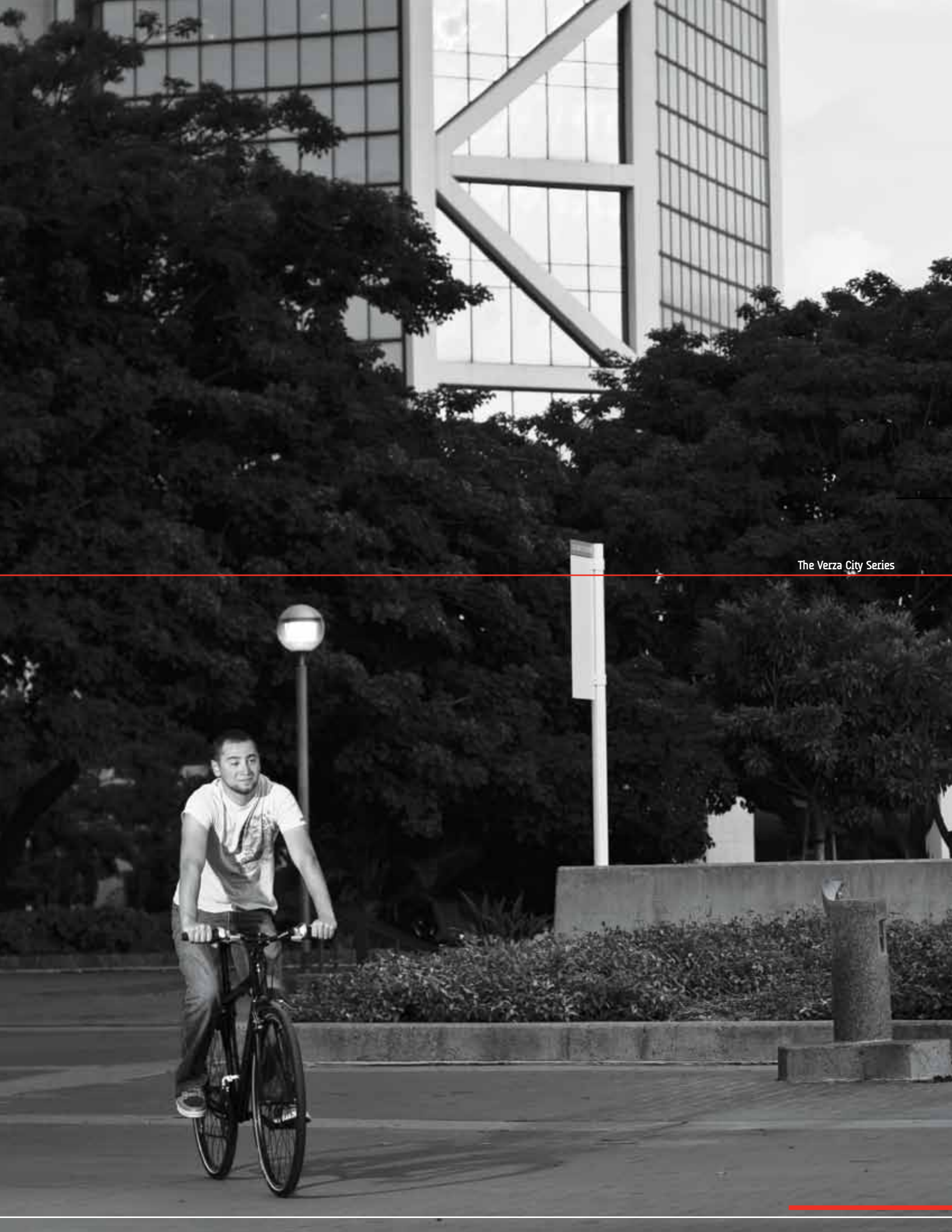
The Verza City Series