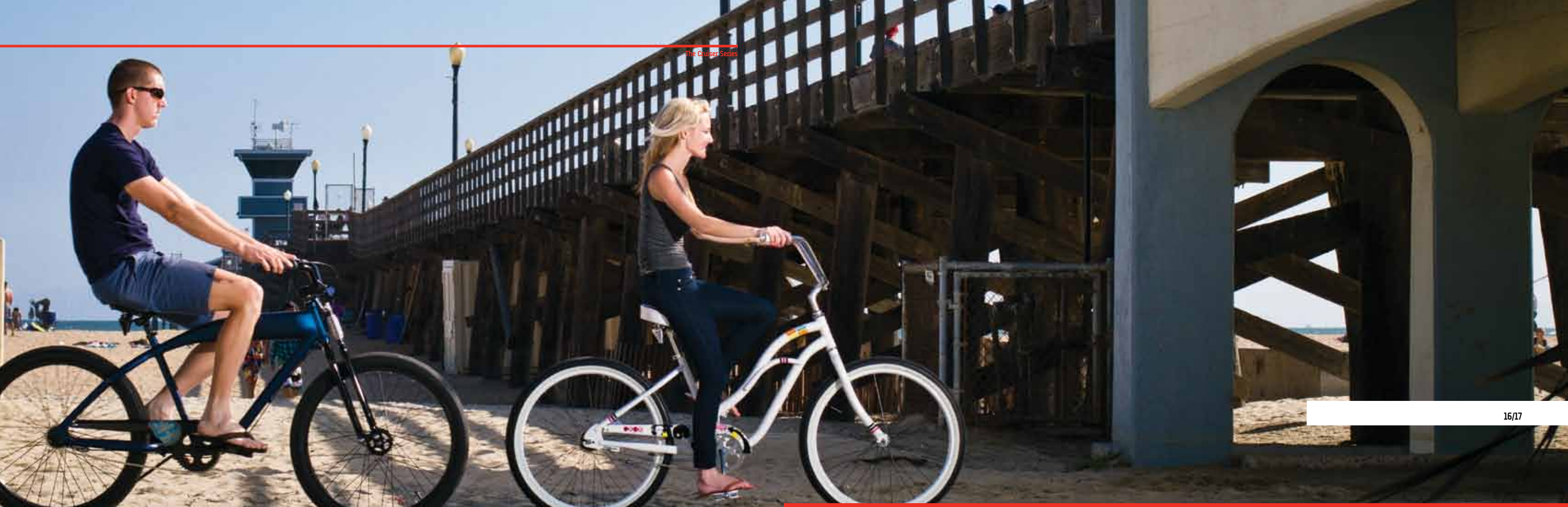
The Cruiser Series