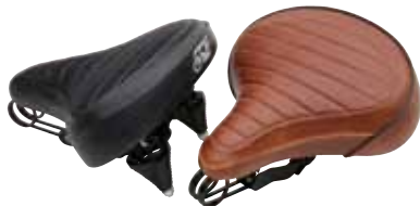
Felt 1903 Cruiser Seat