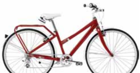
Café8 Deluxe Women's