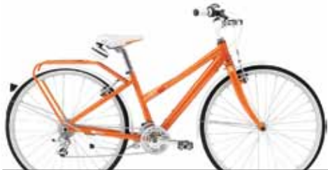
Café24 Deluxe Women's