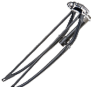
Felt Jerry Springer Cruiser Fork