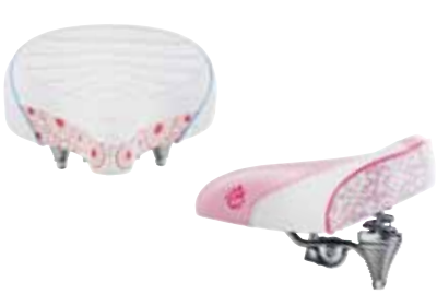
Felt Women's Cruiser Seats