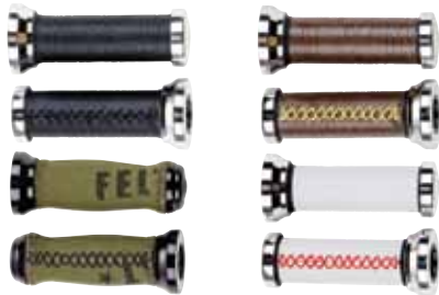
Felt Cruiser Stitch Grips