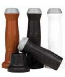
Felt Cruiser and Café Grips