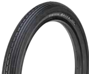
Felt Thick Brick Cruiser Tire